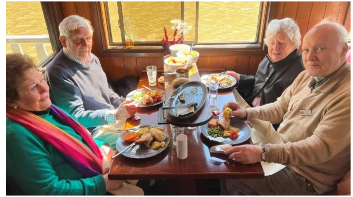
THE LIE DETECTOR

A father buys a lie detector that makes a loud beep whenever somebody lies. The son comes home in the afternoon. Father asks him, "So, you were at school today, right?"